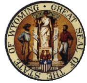
Mark Gordon Governor

Email: wyomedboard@wyo.gov • Website: http://wyomedboard.state.wy.us