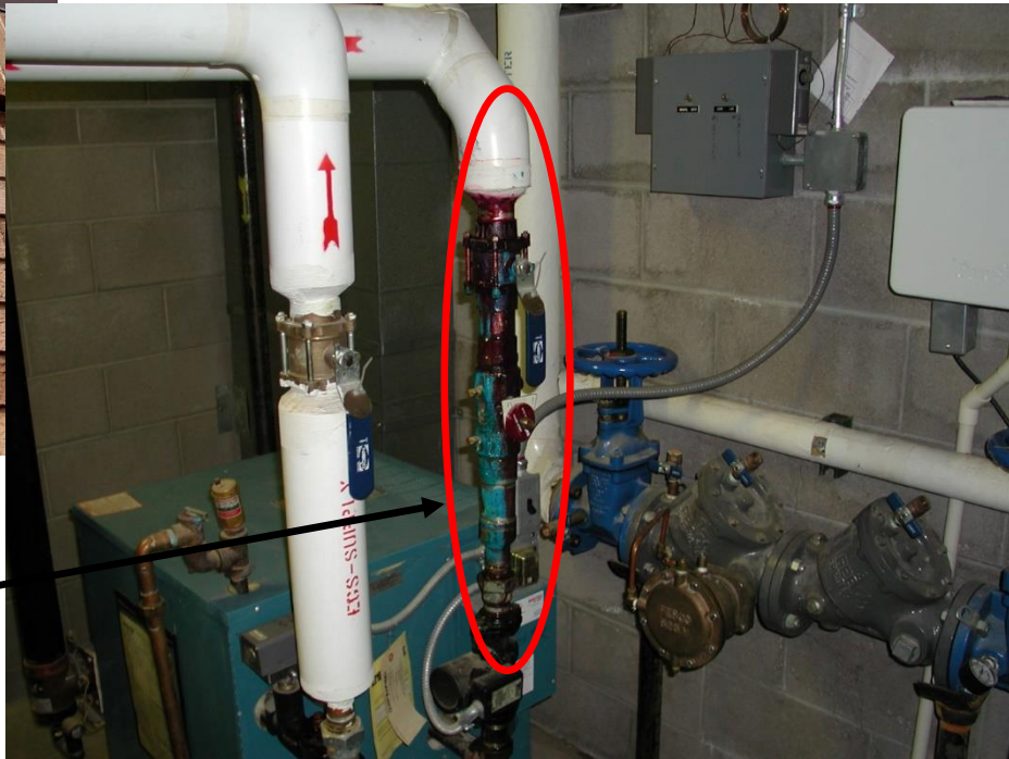
Valve Damage Douglas Deferred