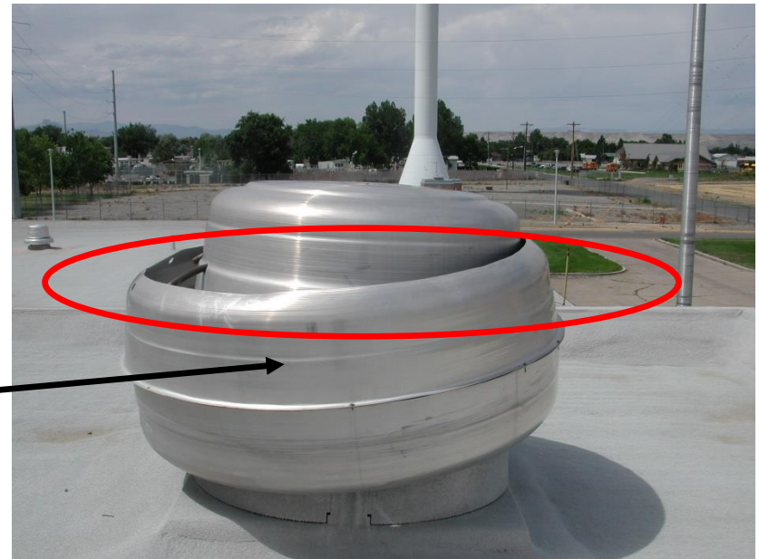
Exhaust Fan Powell - Routine