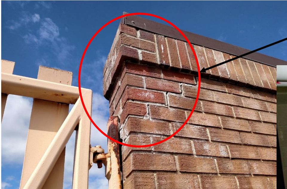
Gate rust and Brick Failure Sheridan - Deferred